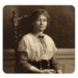
Emmeline Pankhurst stood up for women's rights.