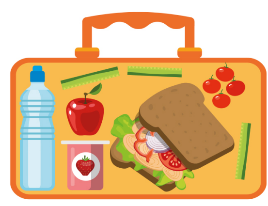
Example of a nutritional packed lunch based on the Eatwell Guide

Choosing nutritional food for a packed lunch can be tricky, especially because processed food and snacks can contain lots of fat and sugar. Choosing a variety of foods from the Eatwell Guide can help to make packed lunches healthier.