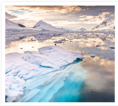
Antarctica is far away from the equator and has a cold climate.

Weather and climate mean different things. Weather is rain, sun or snow and it is changing all the time. Climate is the pattern of weather over a longer time. There are differences in the climate between continents across the world.