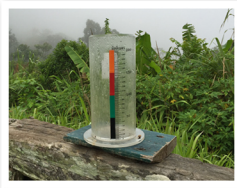
A rain gauge is used to measure the amount of rainfall.