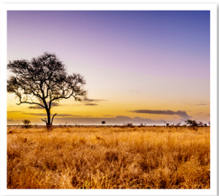
Africa is close to the equator and has a hot climate.