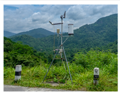
An anemometer is used to measure wind speed.