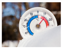
A thermometer is used to measure the temperature.

Weather can be measured using simple equipment.