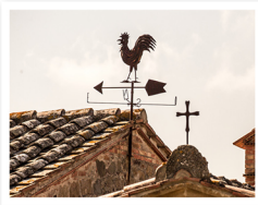
A weather vane is used to show the wind direction.